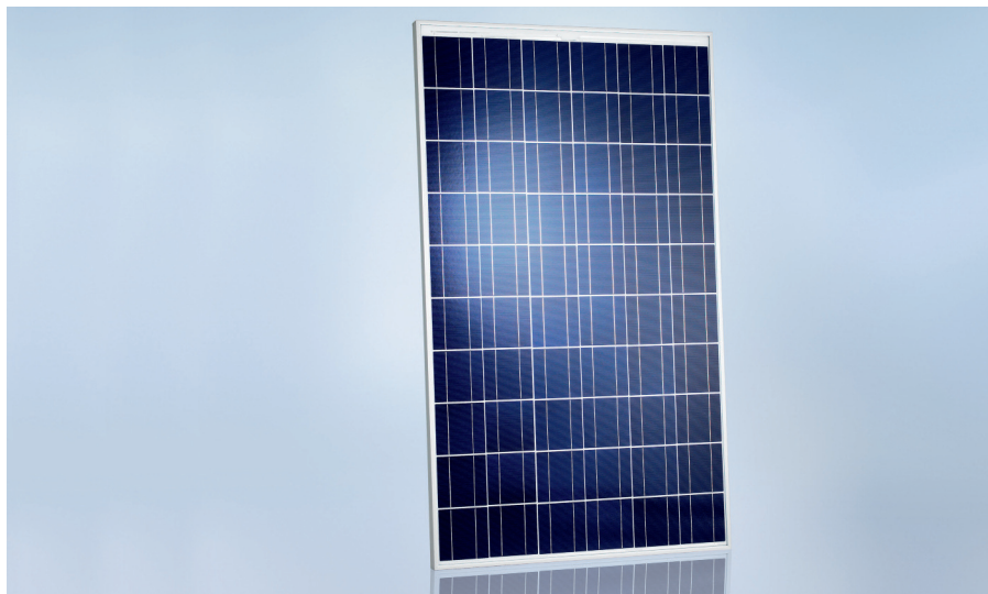
SCHOTT POLY™ 220/225/230/235

SCHOTT Solar has been a leading global developer and manufacturer of solar products for over 52 years. Engineered in Germany and manufactured in America, the high quality SCHOTT Solar PV modules are extremely durable and reliable as demonstrated in several important ways: