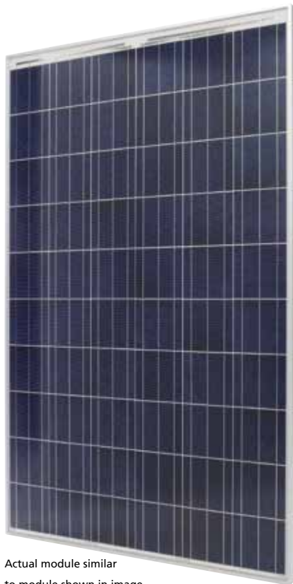
Actual module similar to module shown in image

New: with innovative 42 mm frame profile