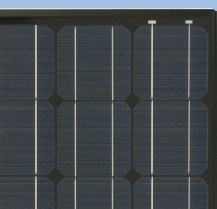
Black frame and low profile racking complement roofline.