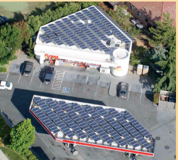
New high efficiency cells each have

Triple tab technology boosts module performance by increasing current collection efficacy.