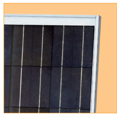
Solder-coated grid results in high fill factor performance under low light conditions.

Sharp's ND-L3EJEA photovoltaic modules offer industry-leading performance, durability, and reliability for a variety of electrical power requirements. Using breakthrough technology perfected by Sharp's 45 years of research and development, these modules incorporate an advanced surface texturing process to increase light absorption and improve efficiency. Common applications include cabins, solar power stations, pumps, beacons, and lighting equipment. Designed to withstand rigorous weather conditions, a junction box is also provided for easy electrical connections in the field, making Sharp's ND-L3EJEA modules the perfect combination of advanced technology and reliability.