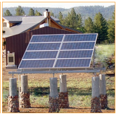
Sharp multi-purpose modules offer industry-leading performance for a variety of applications.