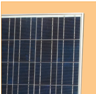
Solder-coated grid results in high fill factor performance under low light conditions.