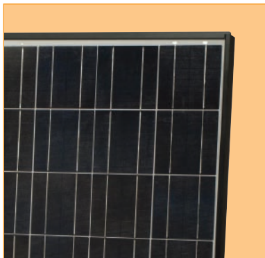
Special side flanges mount easily and securely to Sharp's innovative new racking system