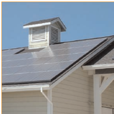
Sharp multi-purpose modules offer outstanding performance for a variety of applications.