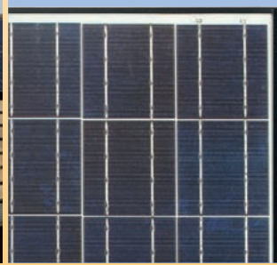
Laminated glass construction in a high torsion frame.