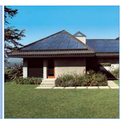
Sharp's triangular modules with black frames, trim strips, and backing sheets allow for the seamless integration of the system into the home's design.