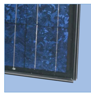
The laminated glass module is glazed into a high torsion black anodized aluminum frame.

Sharp's new triangular photovoltaic modules offer the clean, pleasing look of a high-tech skylight while increasing design flexibility with balanced and attractive rooftop arrays. Engineered specifically for residential hip roofs and complex roof lines, these modules set a new standard in aesthetics. The black anodized aluminum frames, trim strips, and backing sheets blend beautifully with the home's exterior. In addition, an "L" hook design located along the frame's perimeter ensures easy integration with the residential system mounting hardware. These modules also boast high conversion efficiency and are designed to withstand extreme heat and wind. Sharp's ND-070ERU/LU triangular residential system modules—an ideal combination of form and function from the global leader in solar technology.