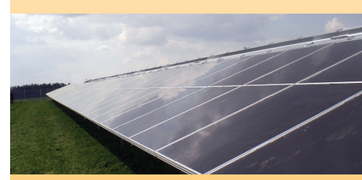
1 MW thin film installation in Munich Germany, April 2009

Single-layer glass with polymeric backskin lowers pounds per watt and transportation costs. Modules are sized to optimize the greatest amount of power, easily handled by one person.